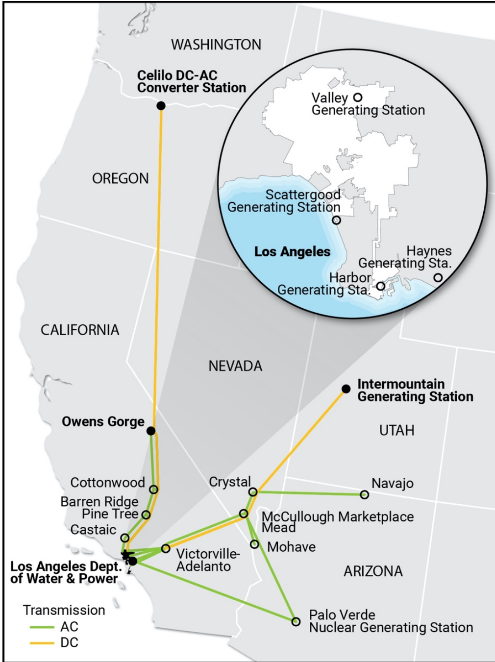
Figure 2. Map of LADWP's service area and major transmission and generation infrastructure

LADWP, the nation’s largest municipal water and power utility, was established more than 100 years ago to deliver reliable, safe water and electricity to LA, and currently serves more than 4 million residents. Figure 2 depicts LADWP’s power system, including major generation and transmission infrastructure outside the city limits.