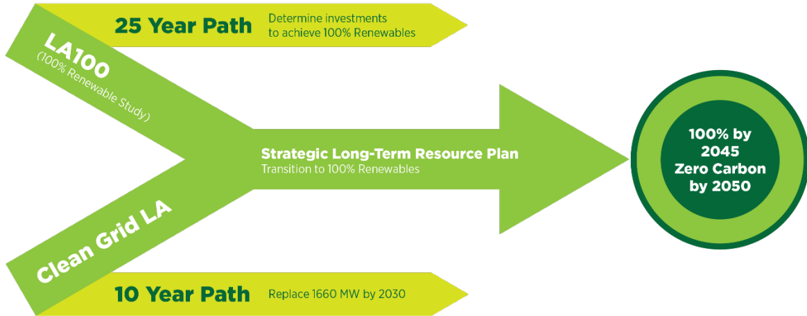
Figure 1. LADWP's planning process to achieve 100% renewable energy