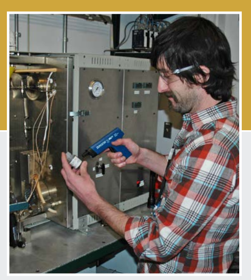
This bench-scale fuel synthesis reactor can be used to test various catalysts over a wide range of conditions using bottled or biomass-derived syngas.

NREL's Fuel Synthesis Catalysis Laboratory (FSCL) provides a wide range of capabilities in heterogeneous catalyst testing. Current research areas of emphasis include the transformation of biomass pyrolysis and gasification products to premium transportation fuels. Test equipment is designed for a broad range of catalysts and reactions, and can be modified to meet special requirements. The FSCL team works closely with synthetic, advanced characterization, and fuel analysis teams to derive the greatest value from every experiment.