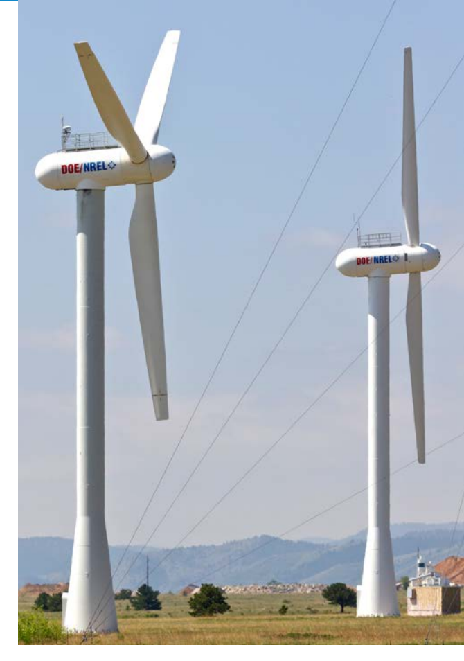
The NWTC's experimental wind turbines, a three-bladed Controls Advanced Research Turbine (CART3) and a two-bladed CART2. Both are used to validate new control schemes and equipment for reducing loads on wind turbine components.

Validating new control schemes is a critical step before new control systems can be implemented in commercial machines and wind plants. Research facilities at the NWTC include two Controls Advanced Research Turbines (CARTs): the two-bladed CART2 and the three-bladed CART3. Both turbines are used to field-test advanced control systems and related technologies.