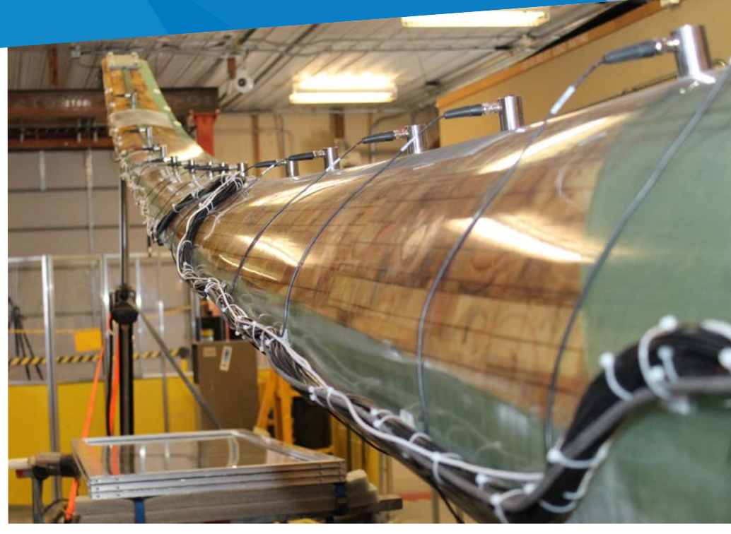
Acoustic emission sensors are mounted to the low-pressure surface of a blade for testing.