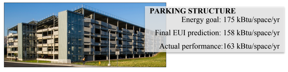
Figure 6. Northeast perspective image of the parking structure.

NREL's parking structure project proves that large garages can be designed and built with world-class energy efficiency at no additional cost. While meeting current and future staff needs with 1,800 parking spaces, the structure features energy efficiency and renewable energy technologies such as daylighting, natural ventilation, an 80% reduction in lighting power density versus code, and a PV array to make the RSF complex (RSF I, RSF II, and garage) net zero energy (NREL 2013). At a construction cost of $14,172 per parking space, the high efficiency garage is cost competitive with other comparable, but less efficient garages.