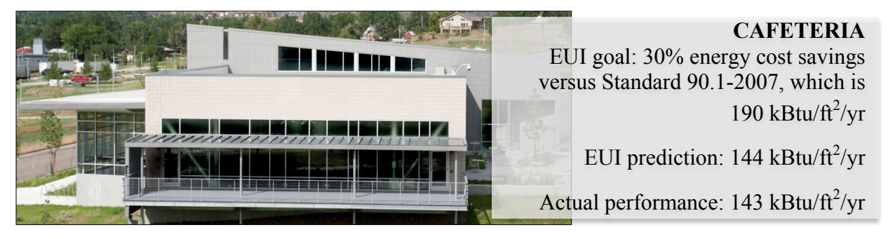
Figure 4. East perspective image of the cafeteria.

The 12,000-ft<sup>2</sup> cafeteria was designed to accommodate 240 guests inside and 70 additional outside. Its efficiency features include daylighting in the dining and servery, with some perimeter daylighting for kitchen staff. Optimal orientation of glazing to the south and north control unwanted summer sun, but allow for winter solar gains and diffuse daylighting year round. A direct/indirect evaporative cooling system provides kitchen and dining area cooling without the use of mechanical cooling equipment.