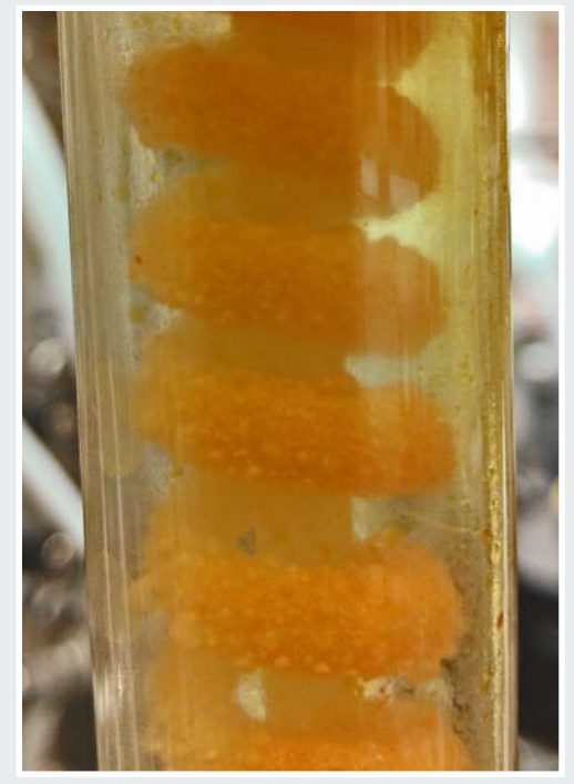
Glass condensers collect upgraded product vapors from the reactor for oil characterization.