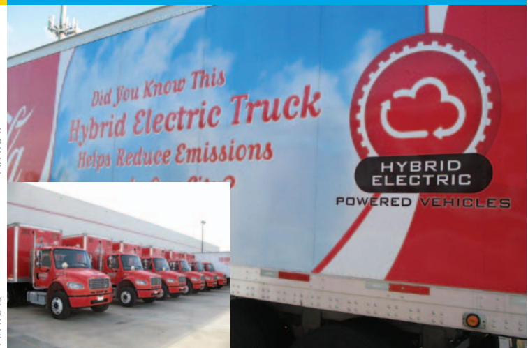
Coca-Cola Refreshments operates hybrid-electric and conventional diesel delivery trucks from its Miami/South Dade depot.