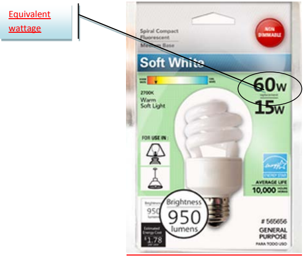
Figure 1. Example of manufacturer-rated baseline wattage 10

Table 1 lists the strengths and limitations of each of these approaches.