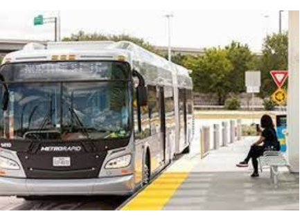
METRO Rapid (BRT)