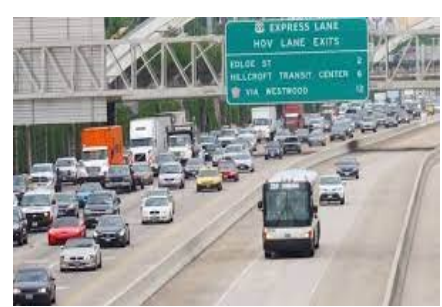
METRO HOV/HOT Lanes