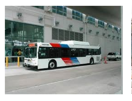
Local Bus Service