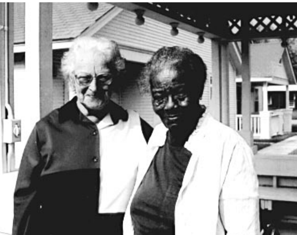
Kevin Virobik-Adams, Progressive Photo / VL731

Youth Hostel —This 2.3-kW, grid-connected, flat-plate system was installed in 1990 on the roof of a