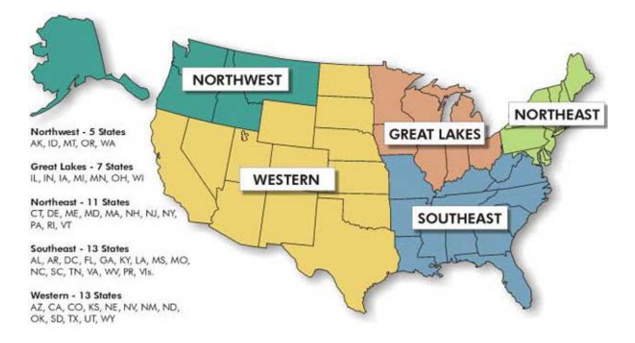
FIGURE 1: RBEP Regional Boundaries

The Regional Biomass Energy Program (RBEP) is a U.S. Department of Energy (DOE) sponsored effort located in five regions of the United States (U.S.). The first regional program was launched in 1979 for several states in the Northwestern U.S. The Congress formally established the RBEP in 1983, and three more regions—the Great Lakes, the Northeast, and the Southeast—were added at that time. A fifth region including the remaining 13 Western states in the continental U.S., was created in 1987. A list of RBEP contacts and the states served by each region is provided on the back cover.