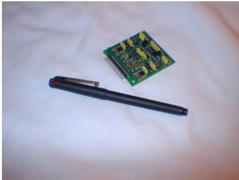
Additional Protection Circuit Added to Production Designs