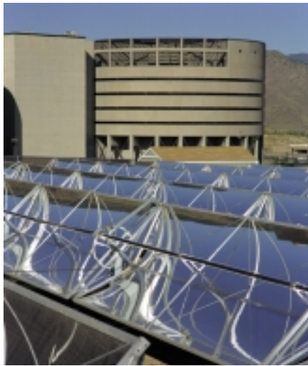
The solar hot water system at the Jefferson County Jail in Golden, Colorado, uses parabolic trough collectors to meet 50% of the facility's hot water needs.

THE KEY COMPONENT IN ALL SOLAR BUILDING TECHNOLOGIES IS THE COLLECTOR.