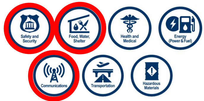
Figure 1. The FEMA Community Lifelines associated with Hillsborough County's Brandon Support Operations Complex (BSOC).

Hillsborough County owns a Resource Recovery Facility (RRF) plant, operated by Covanta, which functions as a micro-grid serving 100 percent of the BSOC load. Operations staff from Covanta contributed input as part of the Utility Engagement Module. The Covanta plant operates independently from the main regional utility grid. While the BSOC is equipped with a 240-hour diesel generator, stakeholders identified that modernization and redundancy are critical considerations, as there is only one feeder line that delivers power from the Covanta plant to the BSOC. The complex would be required to run solely on generator power under extreme emergency conditions, amplifying the need for a clean, reliable back-up power option. Stakeholders also identified potential constraints that would impact solar and storage system feasibility and design, including feeder limits and interconnection agreements. These considerations are informing next steps between the County and utility provider.