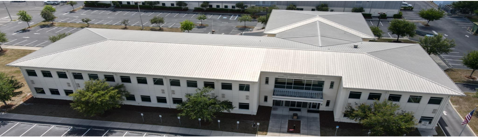
The Brandon Support Operations Complex (BSOC) in Hillsborough County.