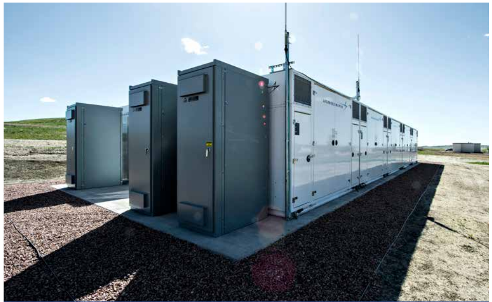
Figure 1. Fort Carson is the tenth-largest military base in the United States, home to 13,000 troops and more than 900 facilities. FEMP helped Fort Carson leverage performance contracting to integrate energy efficiency with an 8.5-MWh battery energy storage system and peak-shaving controls. As a result, Fort Carson benefits by saving approximately $500,000 per year on its electric bill.

We convene key partners, share best practices, promote sustainable technologies, and advance the market.