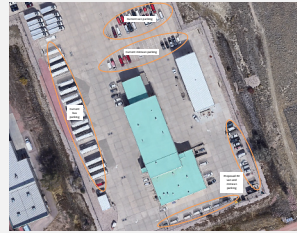
Location (Area Cost Factor or City Cost Index)