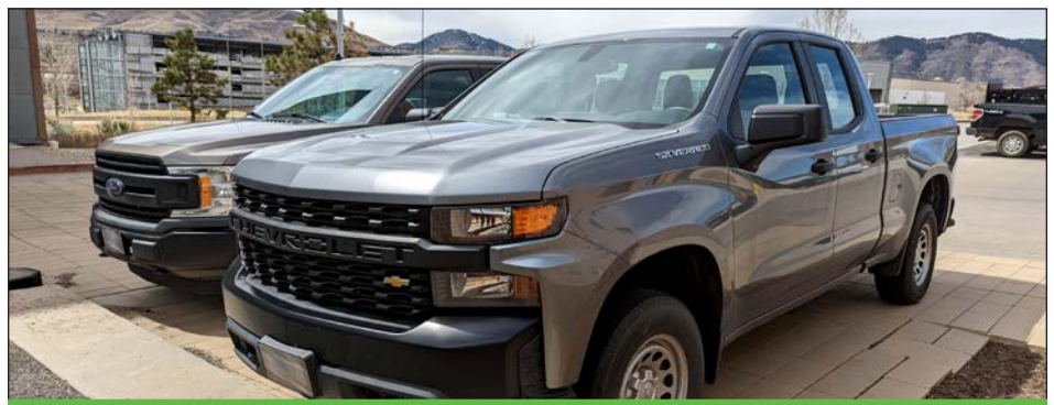
These model year 2020 trucks can use E85. You can find out if your vehicle can use gasoline/ethanol blends up to E85 by looking for a yellow gas cap or badge on the vehicle body, checking the fuel door, or reading your owner's manual.

In the past, FFVs were widely available from multiple manufacturers. Vehicle manufacturers were motivated to receive Corporate Average Fuel Economy (CAFE) credits for producing FFVs. When the regulations for CAFE credits