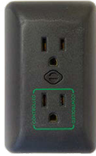
Figure 4. Plug-in smart outlet.

Wireless meter and control systems involve a system of smart outlets that are plugged into existing outlets and measure energy usage. They wirelessly transmit data and can be controlled to turn power on or off. This strategy is effective for automatically controlling devices based on the device schedule and understanding full building and device specific energy usage and behavior.