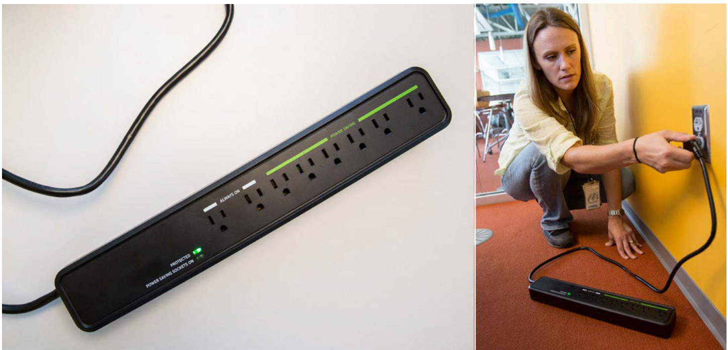
Figure 6. Advanced power strip and its installation. Photos by Werner Slocum, NREL 46058, 46055

Integrated controls are an emerging area that offers potential for connecting lighting, HVAC, and PPL systems to monitor and control them together. They are not widely available yet but will soon be relevant in the market. This strategy is effective for automatically controlling devices and understanding full-building and device-specific energy usage and behavior. Using various sensors (such as occupancy and photosensors), they can connect multiple systems for centralized control and monitoring and further interoperability. The sensor data is logged and can be analyzed to better understand energy savings and the building operation.