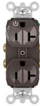
Figure 5. Automatic controlled receptacle.

Automatic receptacle controls are outlets installed in the building that can be controlled to shut off power to appliances based on schedule or occupancy. This may be done wirelessly, using sensors, or using buttons on the device. This strategy is effective for automatically controlling devices and for meeting the most recent ASHRAE standards (ASHRAE 2019) on PPL controls. To determine what method of control (schedule, occupancy) is most relevant for each device, see Table 2-2 in Lobato et al. (2012).