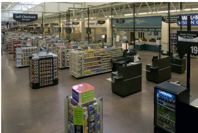
Figure 7. Retail Point-of-Sale equipment.

Retail buildings generally have a large quantity of point-of-sale (POS) equipment. Typical cash register stations (cash register terminal, demagnetizer, bar code scanner/scale, handheld barcode scanner, and, occasionally, a conveyer belt) can have an energy cost of $100/year/POS if powered continuously. The power draw, combined with the extended use pattern, makes POS equipment a good candidate for energy reduction strategies.