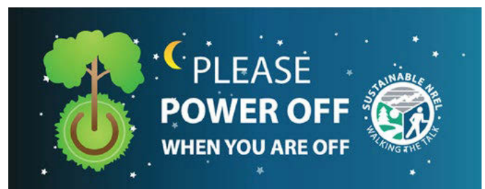
Figure 3. Sticker used at NREL to promote awareness. Illustration by Marjorie Schott, NREL