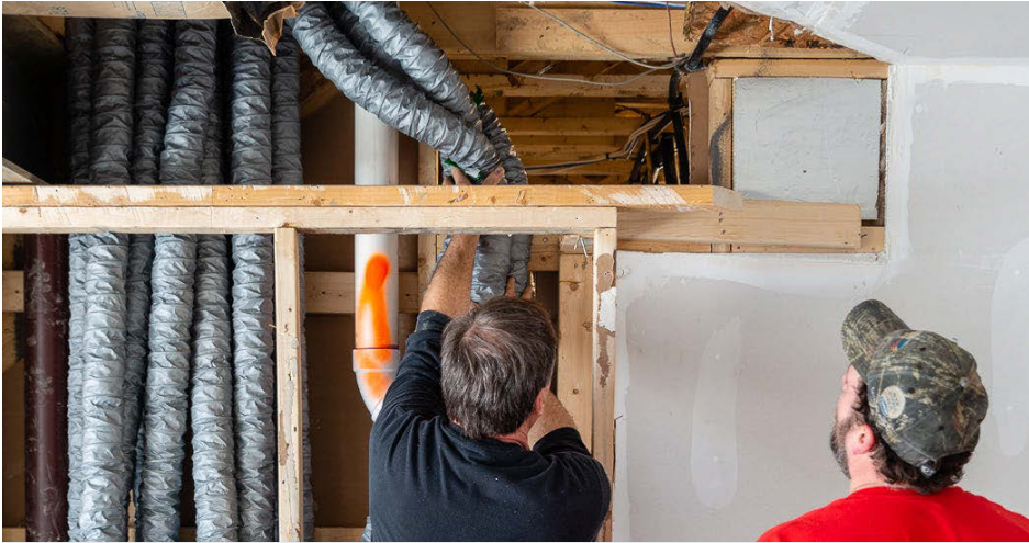
Installation of ducts and rigid, airtight fittings will allow for easy routing within a conditioned space.