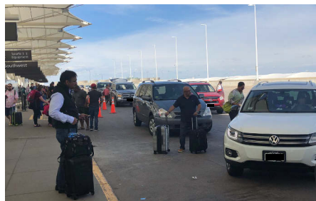
Figure 1. Ground transportation at Denver International Airport