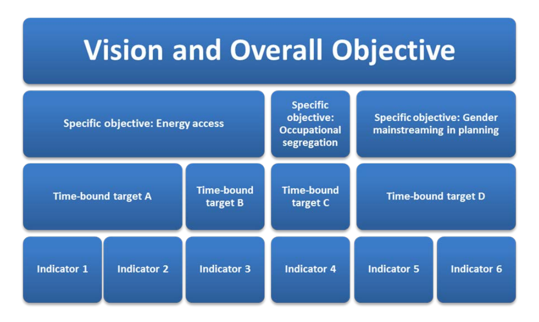
Figure 2: Illustrative organizing principles of a policy on gender mainstreaming and energy

Finally, the policy can specify the institutional roles and responsibilities necessary for implementation and accountability. Any institution assigned a role or responsibility in the policy should have taken part in the policy's development to help shape the policy, provide critical feedback, assess the feasibility of implementation, and provide consent in advance for any new responsibilities to be taken on. Additionally, to assist in getting started with implementation, the policy package can also include any necessary working documents such as a detailed implementation and monitoring plan, reporting templates, and a budget. The outline of the ECOWAS policy is provided in Annex 6 and the full policy, including the monitoring framework, is available at <a href="http://ecowgen.ecreee.org/">http://ecowgen.ecreee.org/</a>.