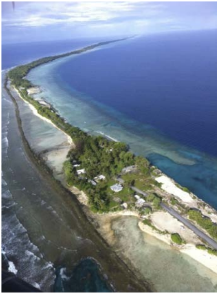
Images courtesy of: OIA logo (Office of Insular Affairs), RMI map (Portable Atlas), island photos (Misty Conrad).