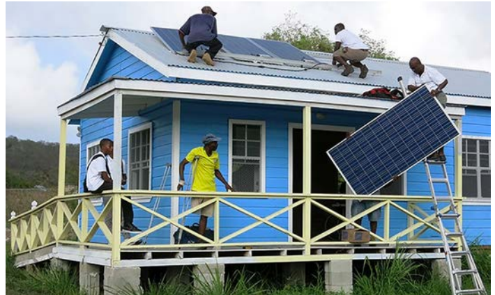
Antigua Barbuda Association for Persons with Disabilities' community solar demonstration project.

The Solutions Center offers peer learning and training through webinars, videos and other resources. The Solutions Center teams with experts and organizations around the world to share diverse views and perspectives through webinars featuring expert commentary and question-and-answer