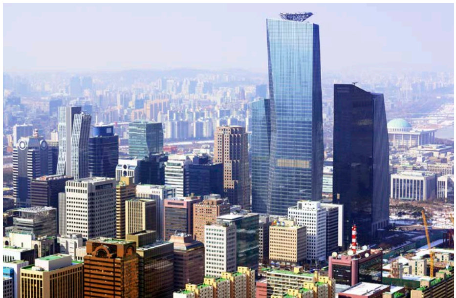
Solutions Center experts provided guidance to help South Korea meet its renewable energy portfolio standards. Shown here: City of Seoul, South Korea.

IMPACT OF ASSISTANCE. Clean Energy Solutions Center policy experts provided guidance to the Korea Electric Power Corporation that will enable it to comply with South Korea's RPS requirement in a way that is most cost-effective for the utility and its customers. The support provided by the Solutions Center will also increase South Korea's probability of successfully meeting or exceeding its RPS targets.