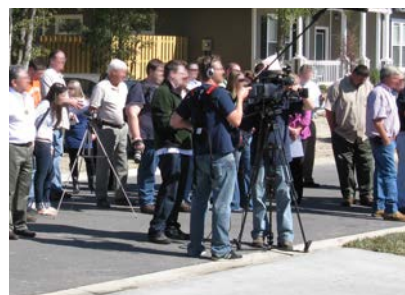
Figure 1. Special events, such as this ribbon cutting for TWH's first zero energy home, draw media attention and crowds.