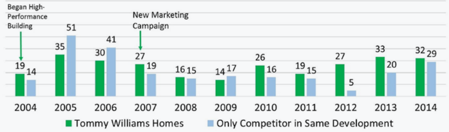
Figure 2. Annual sales data in a development shared by TWH and one other builder.

inspections give us an edge above and beyond the competition.” To prove the substance behind the marketing, TWH pays the homeowners’ electricity bills for the first year—on all the homes it builds, not only the zero energy ones.