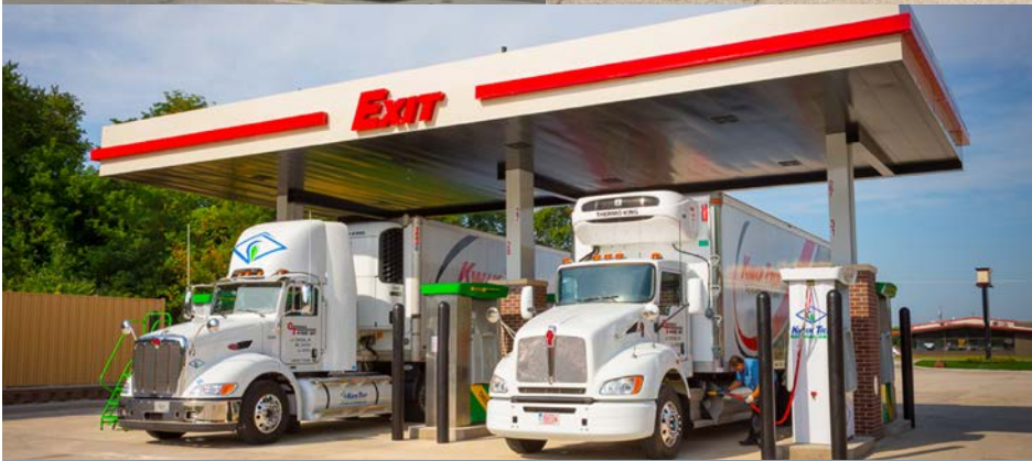
Waste Management operates more than 2,000 natural gas trucks across North America (top left); Enterprise Holdings transports its customers on alternative fuel buses and offers hybrid and plug-in vehicle rentals (top right); Kwik Trip has opened 20 compressed natural gas stations in Minnesota, Wisconsin, and Iowa.