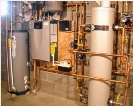
House #3: low-mass, modulating condensing boiler; indirect domestic hot water tank; variable-speed pumps; baseboard convectors. A buffer tank was compared to primary-secondary piping. Constant temperature operation was compared to thermostat setback.

For more Information, see the Building America report, Optimizing Hydronic System Performance in Residential Applications , at www.buildingamerica.gov