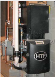
House #2: high-mass, modulating, condensing water heater; variable-speed pumps; baseboard convectors; no primary-secondary piping