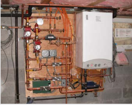
House #1: modulating condensing boiler with an integral tankless coil for domestic hot water and under floor radiant tubing