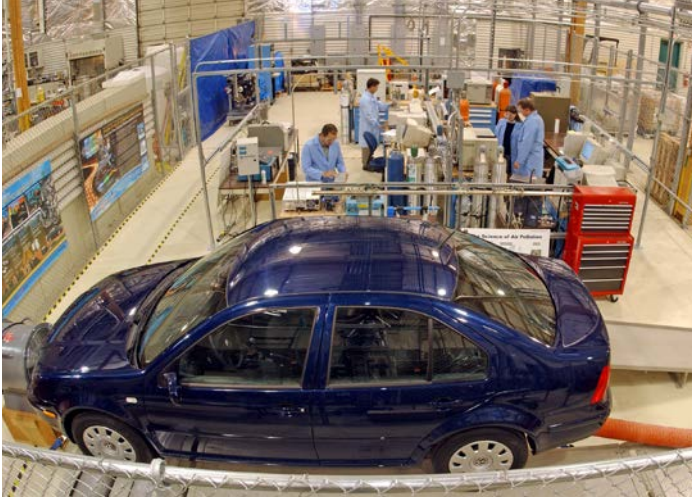
PNNL researchers are helping to advance hydrogen-powered vehicle technology through a variety of EERE-funded projects and applications.