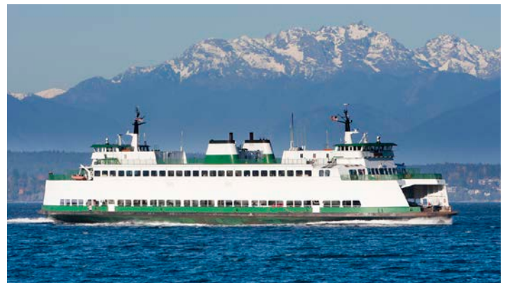
Washington State Ferries is reducing greenhouse gas emissions by fueling up with a biodiesel blend.

Washington State Ferries , owned and operated by the Washington State Department of Transportation, is the largest ferry service in the United States and the third largest in the world. Thanks in part to an American Recovery and Reinvestment Act of 2009 (ARRA) investment from EERE, the ferries now run on a blended biodiesel fuel that will prevent more than 29,000 metric tons of carbon dioxide from being emitted into the environment each year, which is the equivalent of taking more than 6,000 passenger vehicles off the road. Each year, 22 ferries transport 11 million passengers across Puget Sound—consuming 18 million gallons of fuel in the process. 15 EERE’s investment paid for a blending system that combines biodiesel with conventional petroleum-based diesel.