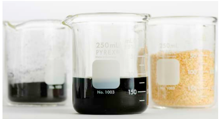
Pyrolysis oil derived from biomass is a viable option to displace petroleum-derived oil.

to a home heating oil substitute, thus displacing imported oil. The biomass-derived home heating oil would be produced from domestic, non-food-based biomass. Deployment of these technologies would help create U.S. jobs and provide other economic benefits. This workshop, which brought together more than 30 experts from DOE, state governments, industry, and academia, addressed the technical and economic challenges that must be overcome to make pyrolysis oil a viable substitute for conventional heating oil. The results of this workshop will inform EERE’s strategic planning for further pyrolysis oil research, development, and deployment.