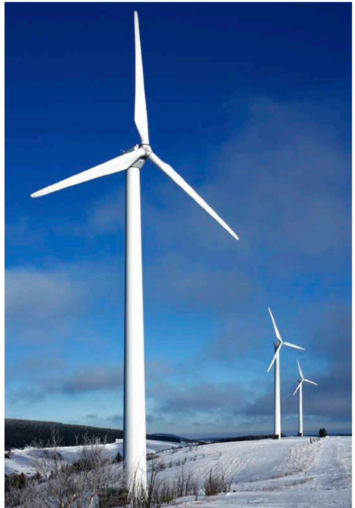
New Hampshire has significant potential for clean, renewable wind power development.