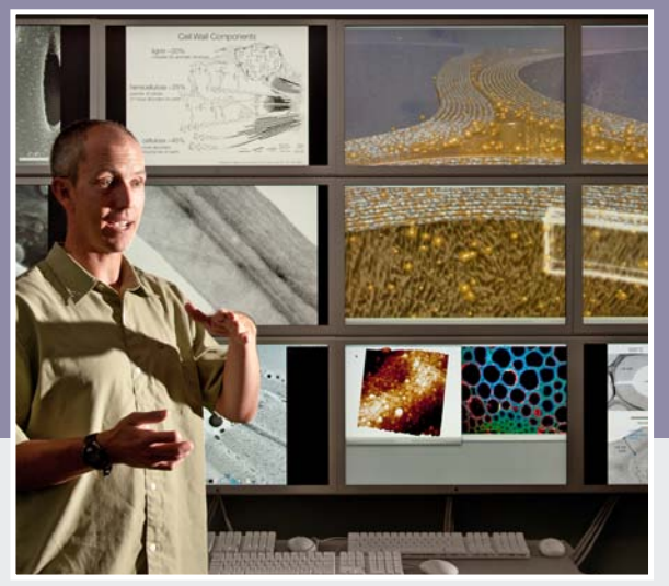
In the cellular visualization room of the BSCL, NREL scientists can look at different views of the ultra-structures of pretreated biomass materials.