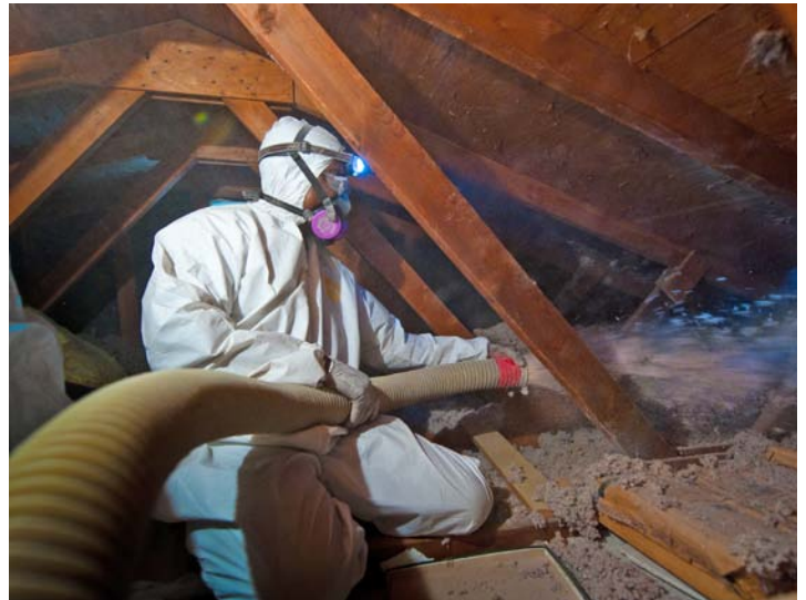
A weatherization worker blows cellulose insulation into the attic of a home, bringing the R value up to R38. Adding insulation to a home is a typical energy upgrade measure.

Habitat for Humanity is developing a model for how to incorporate volunteer labor in home weatherization.