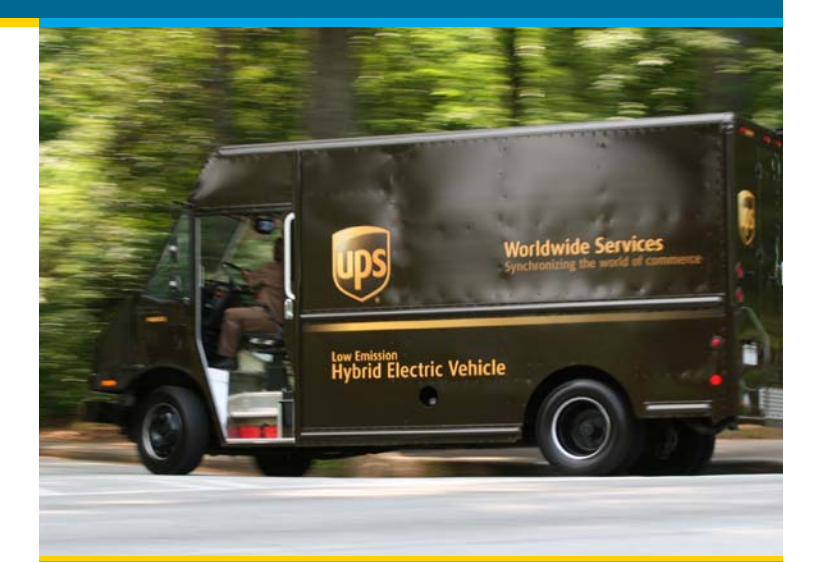
UPS operates 381 hybrid-electric delivery vans nationwide.

This project is part of a series of evaluations performed by NREL's Fleet Test and Evaluation Team for the U.S. Department of Energy's Advanced Vehicle Testing Activity (AVTA). AVTA bridges the gap between research and development and the commercial availability of advanced vehicle technologies that reduce petroleum use and improve air quality in the United States. The main objective of AVTA projects is to provide comprehensive, unbiased evaluations of advanced vehicle technologies in commercial use. Data are collected and analyzed for operation, maintenance, performance, costs, and emissions characteristics of advanced-technology fleets and comparable conventionaltechnology fleets operating at the same site. AVTA evaluations enable fleet owners and operators to make informed vehicle-purchasing decisions.