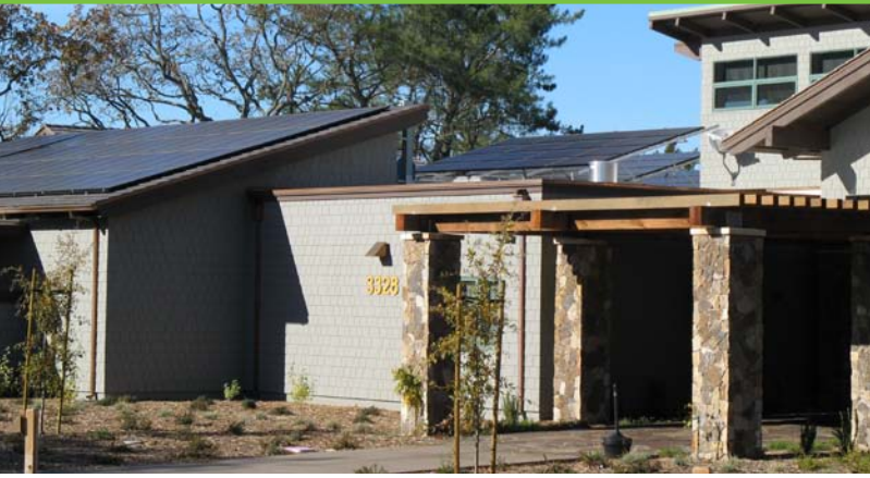
The City of Santa Rosa implemented the Clean Energy Advocate program. This program will help residential and commercial property owners navigate the process of selecting projects and applying for financing and incentives.