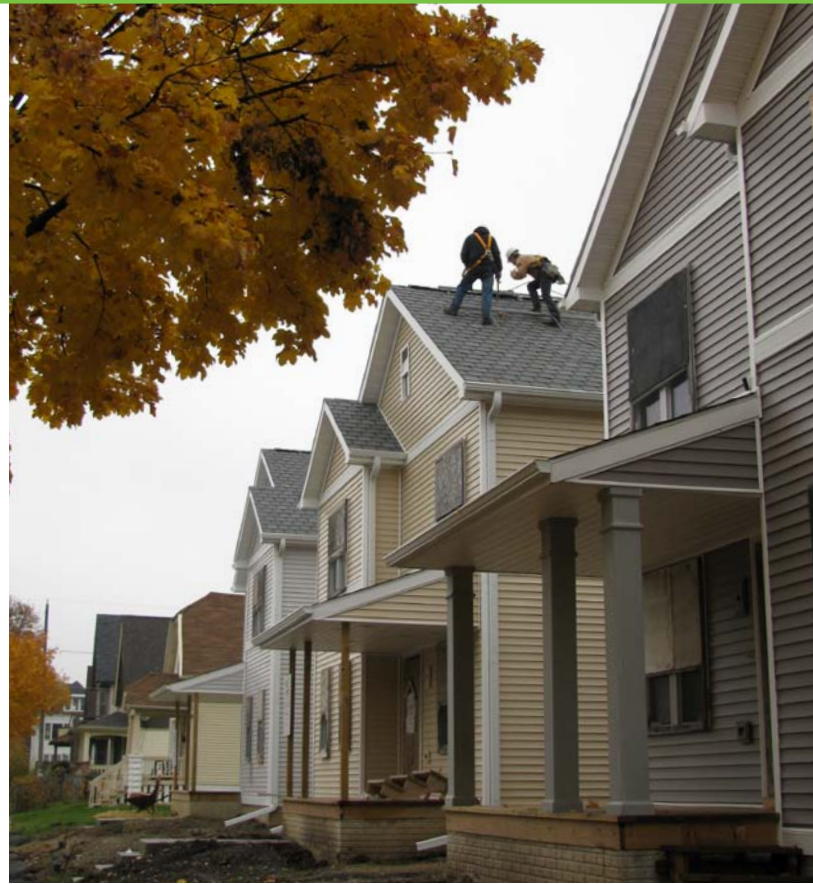
Installers get hands-on experience installing solar hot water panels on a Habitat for Humanity home.

Brand Confusion. There was sometimes difficulty in pairing the existing brand and communications of MREA and Milwaukee Shines, especially at the beginning. MREA’s logo and branding is well known in the solar community. Milwaukee Shines was not well known, and did not have a logo established until well into the solar coach contract. To connect Milwaukee Shines to the solar community,”