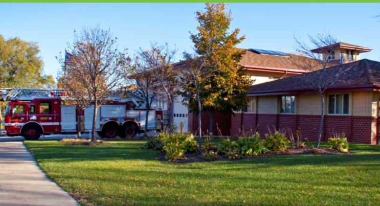
A Milwaukee fire station features a new solar hot water system, courtesy of the city's hands-on workshop.