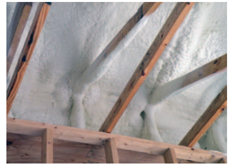
Open-cell spray foam insulation on the underside of the roof deck provides up to R-30 thermal performance, bringing the attic into the conditioned space.

Understanding the interaction between each component in the home is paramount to the systems-engineering approach. Throughout design and