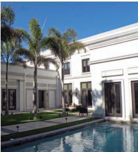
The New American Home 2011

Continental Homes & Interiors: 407-226-3546