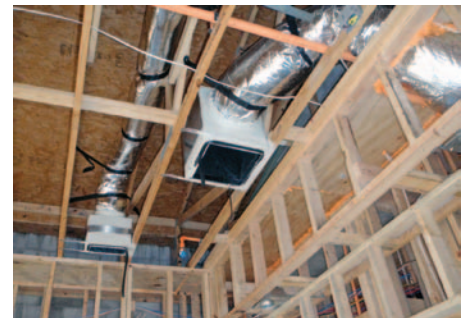
All ductwork is within the conditioned space and well-sealed using mastic.

construction, the relationship between building site, envelope, mechanical systems, and other factors is carefully considered. Recognizing that features of one component can dramatically affect the performance of others enables Building America teams to engineer energy-saving strategies at little or no extra cost.