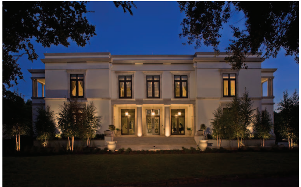
The New American Home® 2011, Orlando, Florida