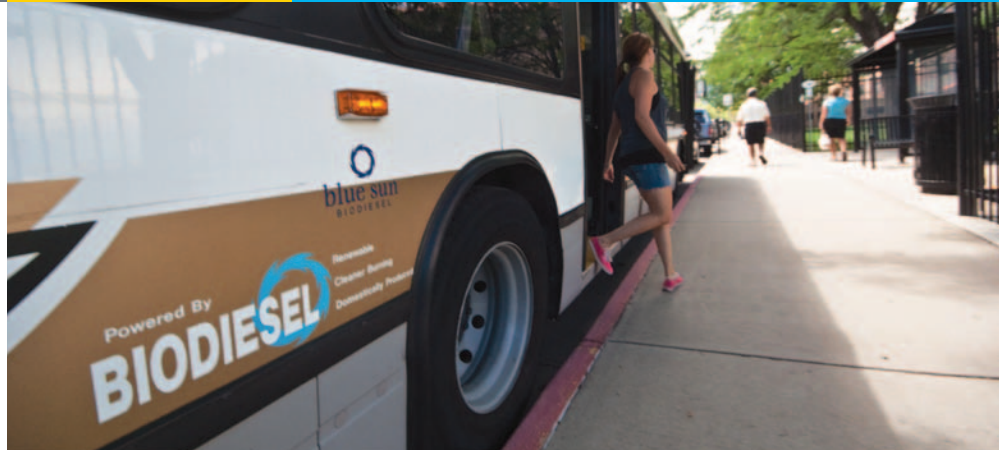
Biodiesel works well in many applications, such as this B20 transit bus at the University of Colorado at Boulder.

Most original equipment manufacturers (OEMs) approve blends up to B5 in their vehicles. Some approve blends up to B20, and one manufacturer even approves B100 for use in certain types of its farm equipment. However, some OEMs don't recommend using