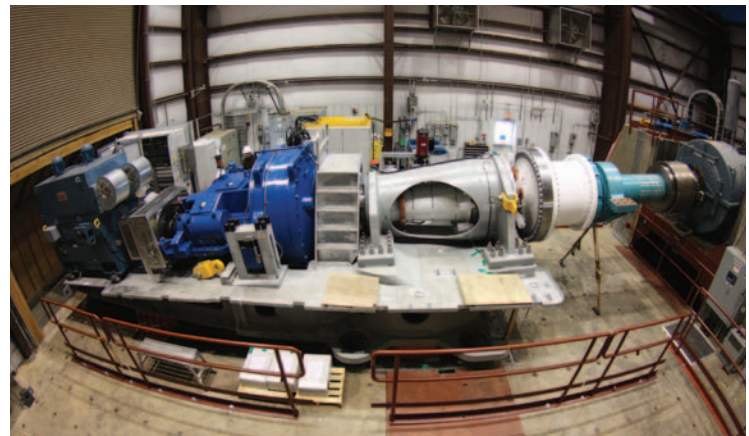
2.5 MW prototype turbine undergoing dyno testing.

NWTC dynamometer facilities are available for industry users. Contact the NWTC for testing inquiries at 303-384-6900.