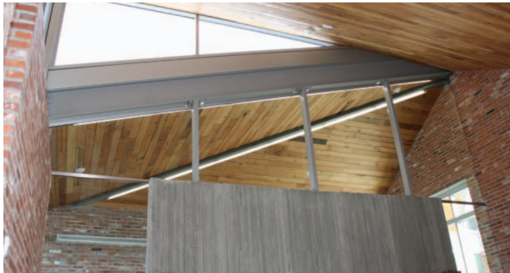
Daylighting built into the roof helps offset electrical lighting needs.