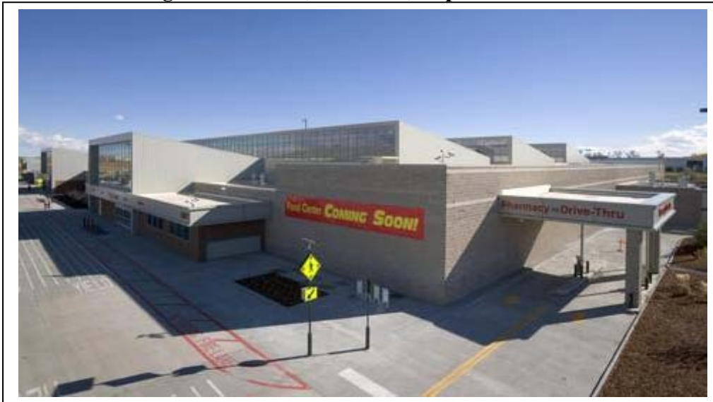
Figure 1. Aurora, Colorado, Experimental Store

energy systems. This paper presents the major energy system experiments in HVAC, refrigeration, lighting, and renewable energy generation at the Colorado experimental store.