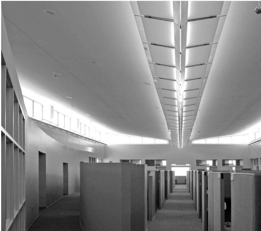
Figure 4. S&TF interior office area

and Acceptance, and Warranty. Commissioning at the Construction and Acceptance phase includes startup and testing of selected equipment. For the Warranty phase, it includes coordinating required seasonal or deferred testing and performance evaluations and reviewing the building 10 months after occupancy.