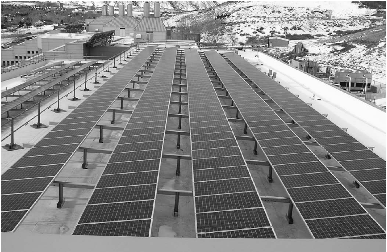
Figure 3. S&TF PV system looking west with the NREL SERF laboratory building in the background.