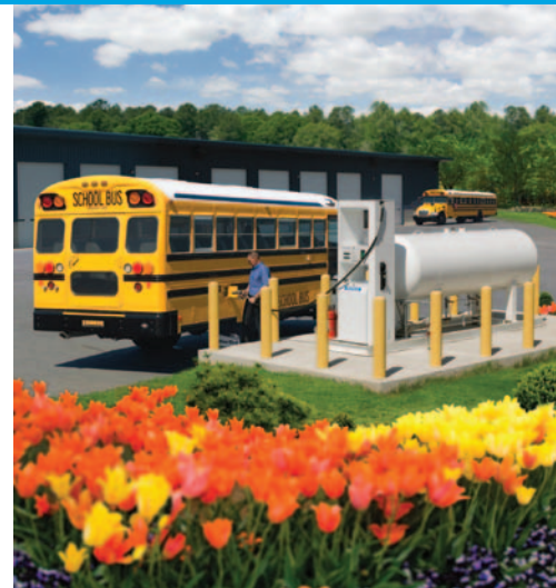
Lower maintenance costs are a prime reason behind propane's popularity for high-use vehicles, such as school buses.

Propane vehicles operate much like gasoline vehicles with spark-ignited engines. There are two types of fuel-injection systems available: vapor and liquid injection. In both types, propane is stored as a liquid in a relatively low-pressure tank (about 300 psi). In a vapor-injected system, liquid propane is controlled by a regulator or vaporizer, which converts the liquid to a vapor. The vapor is fed to