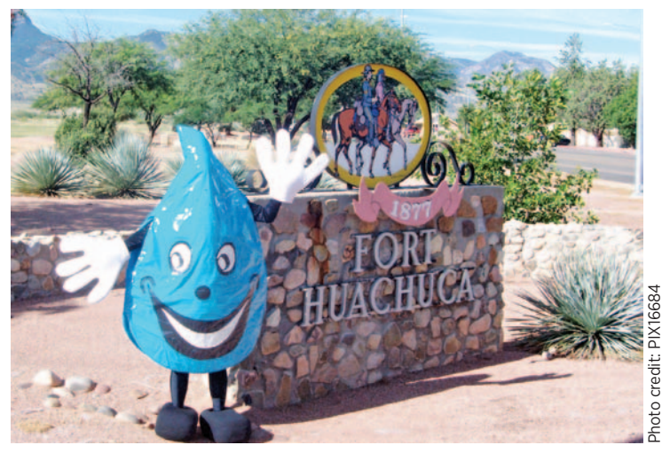
Wettie the Water Drop stands at the Fort Huachuca main gate.

"Where's Wettie the Water Drop?" is another successful campaign co-sponsored by the Fort Huachuca Scout newspaper and WWES. The newspaper features a photo of Wettie, the WWES mascot, along with a water project. Readers guess what water conservation measure Wettie is demonstrating for a chance to win prizes, such as a five-minute shower timer, leak gauge, or other water saving tools.