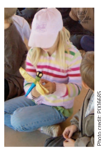
A student participates in water conservation lessons about the San Pedro River near Fort Huachuca

Youth education shifts student knowledge from general concepts to a deeper understanding and sense of personal connection to water as a limited resource. Three concept areas are covered; basic water science, aquifers and watersheds, and conservation. The program offers more than 30 interactive water classes taught in schools on post and in Fort Huachuca after school programs. Staff typically teach 100 classes each year with more than 2,000 total interactions with students. Some of the more popular classes include: