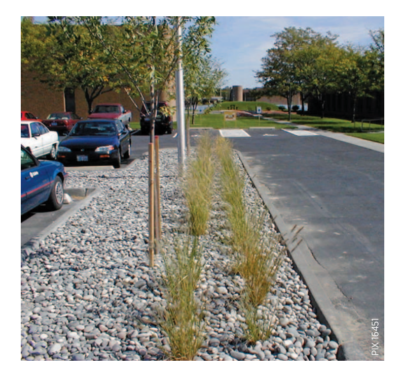
PNNL grounds personnel converted this parking median from traditional turf shrub landscape to a xeric landscape with native bunchgrass.

To further reduce water use while maintaining aesthetics, PNNL is creating gardens to feature native plants from eastern Washington. In addition, the laboratory is adding walkways throughout the campus to encourage staff and visitors to walk from one building to another instead of