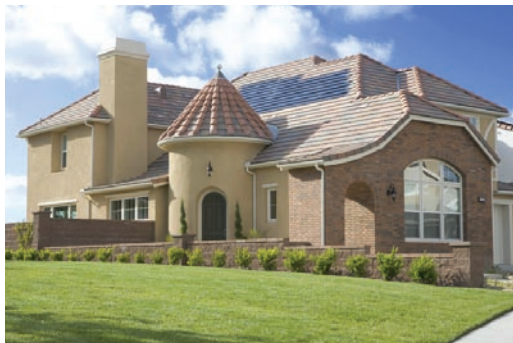
Shea Homes included BIPV as standard equipment on homes in this California development.

In addition, making the solar investment with energy efficiency upgrades often results in an immediate positive cash flow for the home buyer. In other words, the higher mortgage payment is offset by lower utility bills from day 1 . Some mortgage products even credit a home's energy efficiency in the mortgage itself, giving borrowers the opportunity to stretch debt-to-income qualifying ratios on loans to qualify for a larger loan amount.