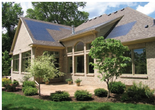
Although a south-facing orientation is best, solar systems will perform well at different orientations, as this Ohio home demonstrates.

Carefully assess present and future shading. Shading by maturing trees or nearby construction is far more likely to affect solar system