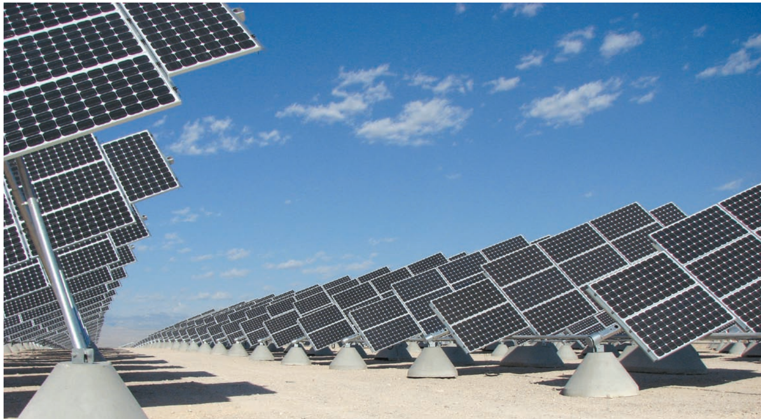
14.2-megawatt solar electric system at Nellis Air Force Base, Nevada.

S olar energy is a clean, abundant renewable energy source that is vital to our energy security and independence. Solar technologies use the sun to provide heat, light, hot water, electricity, and even cooling for homes, businesses, and industry.