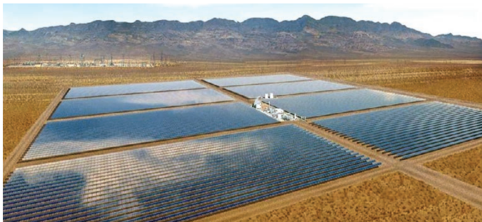
64-megawatt solar plant in Boulder City, Nevada.

Printed with a renewable-source ink on paper containing at least 50% wastepaper, including 10% postconsumer waste