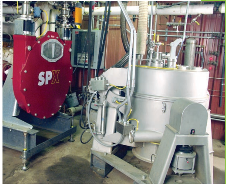
Automated basket centrifuge and pump separate sugar-rich liquors from pretreated biomass slurries.