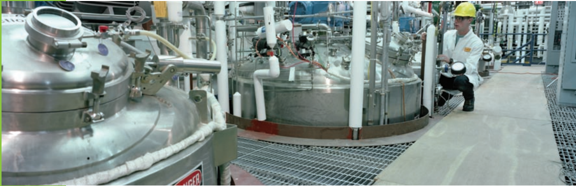
9,000-L fermentation tanks in the Biochemical Pilot Plant.