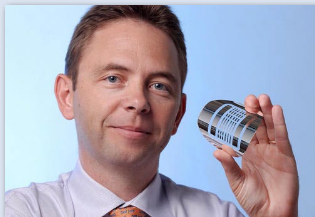
Professor Bernard Kippelen holding an electronic circuit fabricated on a flexible plastic substrate. The solar cells he is developing can be integrated with such organic electronic devices.

The funding structure for this solicitation is intended to be flexible and cyclical. The performance period of each project is 18 months with the possibility of project termination after a DOE stage gate review at month nine. The projects have been structured so that companies can receive their funding from DOE only upon successful delivery of pre-specified samples of new hardware. This approach will allow early-stage companies to focus on demonstration of technology, while assuring that taxpayers get the best value for their investment in these projects.