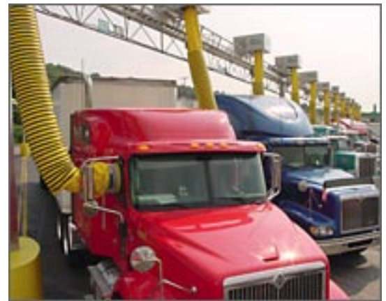
Educating truckers and station owners is key to expanding the use of idle reduction technologies in the U.S.