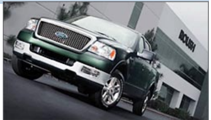
Roush is taking orders for a September 2007 delivery of the LPG Ford F-150, which comes in two fuel-tank options.

Based on survey responses from potential purchasers, Roush is offering two fuel-tank options in the LPG F-150s: a 22-usable-gallon tank and a 50-usable-gallon tank. The vehicles are available in all variations of the F-150. Ford provides the vehicles near the end of its assembly line; Roush makes the necessary installations