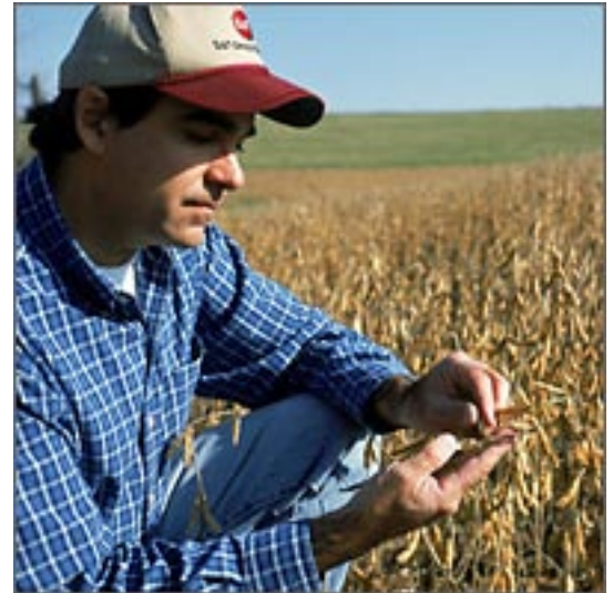
Farming biodiesel crops could help preserve a sensitive watershed area in Virginia.

The Consortium is pleased with the outcome, says South Shore Clean Cities coordinator Carl Lisek. "All three of our coalitions have hosted our own separate idle reduction conferences in the past, but we feel this collaboration was an excellent way to pool our resources."