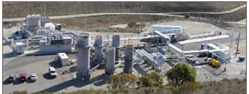
OCTA transit buses will use all the LNG produced by Bowerman Landfill in Orange County, Calif.

Completed in December 2006, the new plant—the first of its kind—is currently producing about 1,000 gallons of LNG per day and expects to increase daily production to 5,000 gallons during its first phase. At this production level, the plant will reduce carbon dioxide output by the equivalent of 10,000 tons per year.