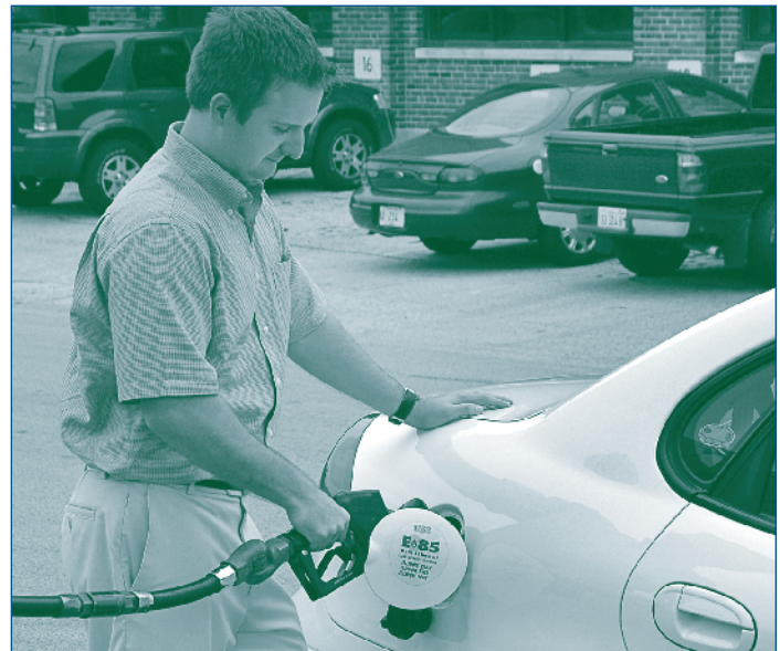
Sixteen percent of Illinois' 12,100 state vehicles are E85-capable FFVs.

The first, implemented in 2003, addressed the incremental cost of E85. By eliminating the state sales tax for E85, the measure allows E85 to be priced more competi-