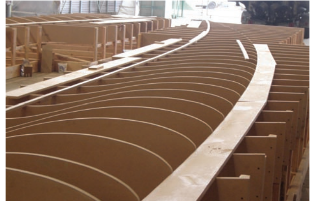
The initial mold fabrication for Knight and Carver's sweep twist blade.

Project Description: Knight and Carver will develop a sweep-twist adaptive blade (approximately 28 m long) to reduce operating loads and allow a larger, more productive rotor. The blade design will use outer blade sweep to create twist coupling without angled fiber. This concept has potentially significant cost and manufacturing advantages. After the design phase, several prototypes blades will be built using a unique fabrication process. Following static and fatigue tests, three blades will be flight tested on an existing 750-kW turbine and resulting data will be compared to the baseline.